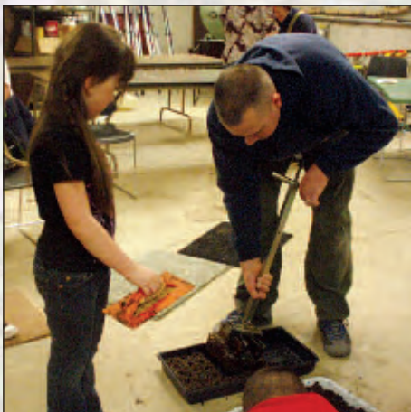
Room for improvement