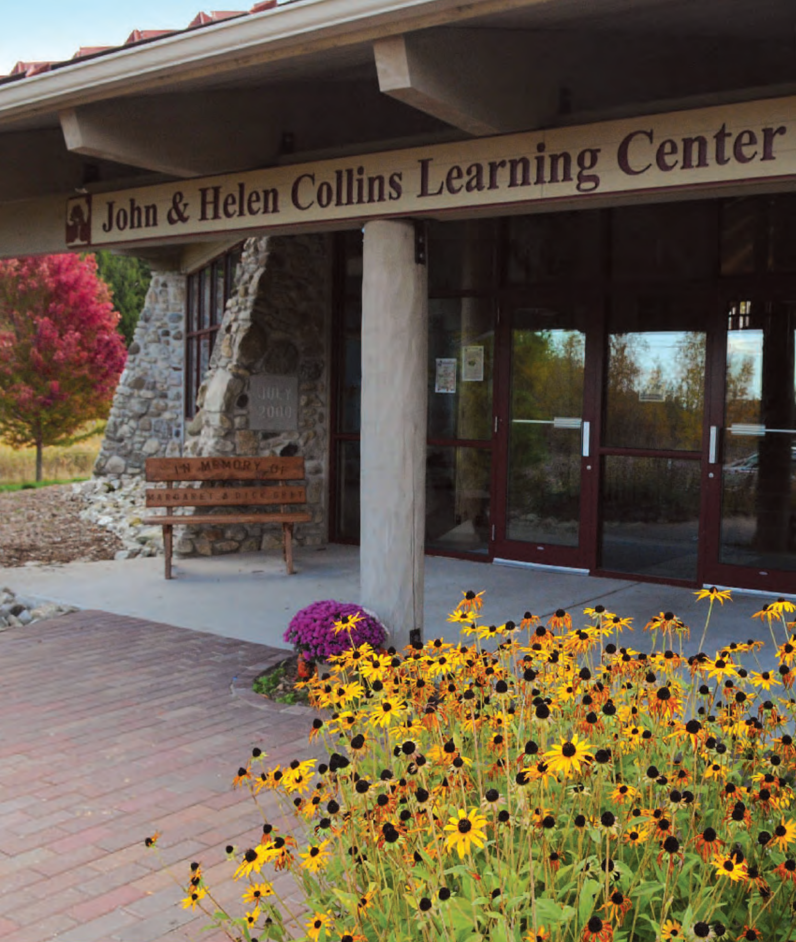
Crossroads at Big Creek